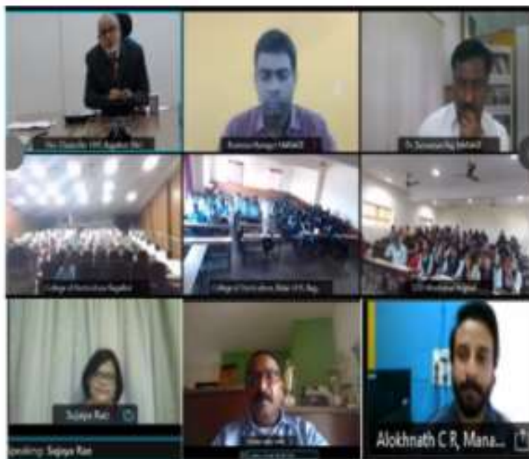
Online workshop organized by MANAGE faculty to all campus students